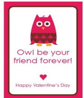
Simple Valentine Day Card

For you see, Valentine's day was coming up as I was reading about God's love after this break up. For me it felt that being alone on Valentines day after a break up is much like having your body completely sun-burned then being left in