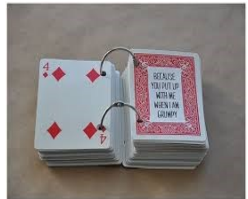
Valentine Gift Ideas!!

I encourage all of you, who are reading this to try some simple acts to show God's love to your school or work place you will be amazed at how much of an impact it can have. Thank you all for your time and God Bless you until we speak again!