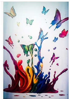
A picture I took while visiting the Seaport Village Art Gallery.